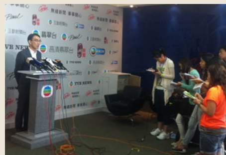
原文刊於星島日報(A08) 2013年8月15日 Published in Sing Tao Daily (A08) on 15 August 2013