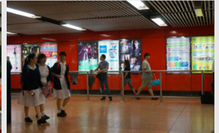
5. 尖東及旺角等約九十個港鐵站均擺放了《監警有道》的燈箱廣告。 4-sheet panel ads were placed in 90 MTR stations, including Tsim Sha Tsui East and Mong Kok stations.

設置巨型橫額，更於附設的103吋高清電視播放長達1分鐘的劇集預告片。除了平面廣告，會方亦安排在沙田、上水及旺角東三個港鐵站內的等離子電視圈播放劇集的精華片段，讓市民先睹為快。此外，新巴及城巴車廂內的電視亦有播放《監警有道》的製作特輯，披露一眾演員飾演監警會委員及審核主任的體會和拍攝花絮。監警會同時在不同的網上平台設置橫額廣告，例如YouTube、新聞網站以及各大網上討論區等，預計曝光率可達700萬次。劇集於YouTube監警會頻道上宣傳，而劇中演員的Facebook專頁亦可找到有關劇集的消息，都市日報則刊登《監警有道》首四集的專題文章，讓讀者率先了解劇集詳情。劇集宣傳海報分別張貼於全港各區警署報案室、中學、圖書館、公共屋邨及民政事務署。