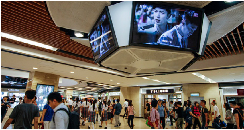
6. 沙田港鐵站內的等離子電視圈播放劇集精華片段，讓市民先睹為快。 The public can preview the upcoming episodes from the highlights clip shown at certain plasma TV rings, such as the one at Sha Tin station.