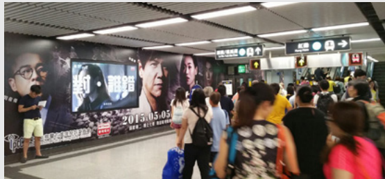
4. 九龍塘港鐵站內的巨型橫額及宣傳片吸引了不少行人駐足觀看。 The power banner and embedded trailer at Kowloon Tong station, attracting much public attention.