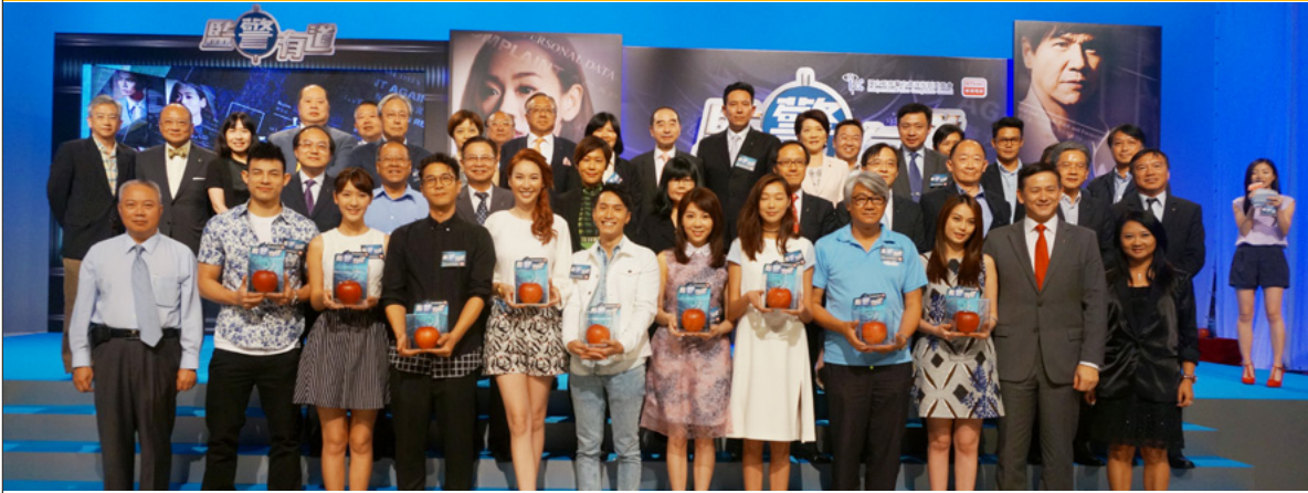
2. 監警會委員、一眾演員及出席嘉賓在台上大合照。 Group photo of IPCC Members, actors and attending guests.