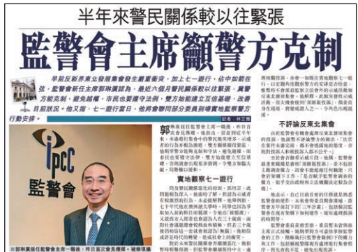
原文刊於星島日報 (A10) 2014年6月24日 Published in Sing Tao Daily on 24 June 2014 (A10) 半年來警民關係較以往緊張 監警會主席籲警方克制