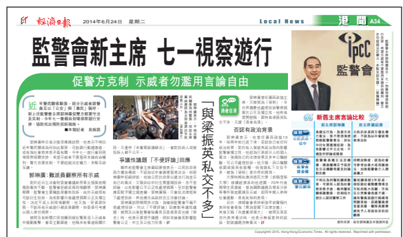
原文刊於經濟日報 (A34) 2014年6月24日 Published in Hong Kong Economic Times on 24 June 2014 (A34) 監警會新主席 七一視察遊行 促警方克制 示威者勿濫用言論自由