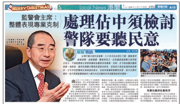
原文刊於星島日報 (A10) 2014年12月25日 Published in Sing Tao Daily on 25 Dec 2014 (A10) 監警會主席：整體表現專業克制 處理佔中須檢討 警隊要聽民意

郭琳廣主席於報告期內接受南華早報、經濟日報、明報、信報、星島日報、東方日報、蘋果日報、人民日報、財新雜誌、新華社、香港電台節目《香港家書》和《視點31》、商業電台、有線電視、無線電視、now TV、亞洲電視、鳳凰衛視《時事大破解》和DBC的訪問，概述監警會的歷史、職能及未來的發展，並討論監警會如何就公眾關注的議題和警方及持份者加強聯繫。