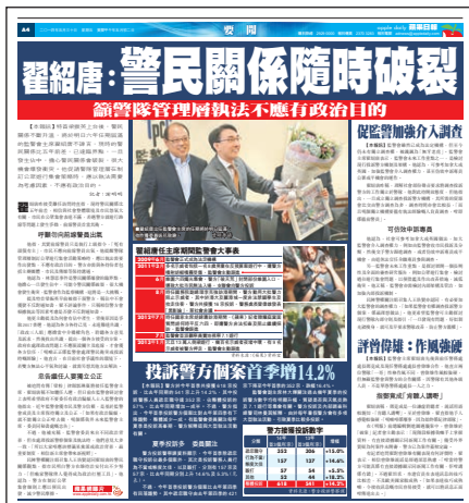
原文刊於蘋果日報 (A04) 2014年5月30日 Published in Apple Daily on 30 May 2014 (A04) 翟紹唐：警民關係隨時破裂 願警隊管理層執法不應有政治目的