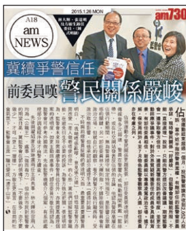
原刊於am730 (A18) 2015年1月26日 Published in am730 on 26 January 2015 (A18) 冀續爭警信任 前委員嘆警民關係嚴峻