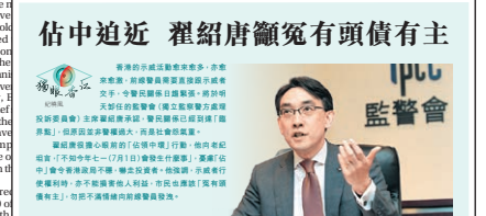
16 壹報 www.hkex.com 網眼香江 2014年5月30日 星期五