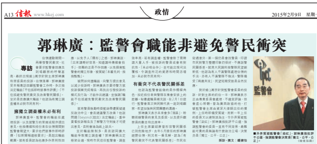
原文刊於信報財經新聞 (A13) 2015年2月9日 Published in Hong Kong Economic Journal on 9 Feb 2015 (A13) 郭琳廣：監警會職能非避免警民衝突 鳴謝信報財經新聞有限公司惠允轉載編號 (2015JUL07003) Reprinted and distributed by permission of Hong Kong Economic Journal Company (2015JUL07003)