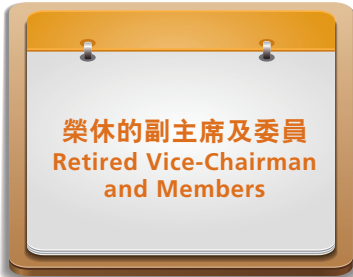
榮休的副主席及委員 Retired Vice-Chairman and Members