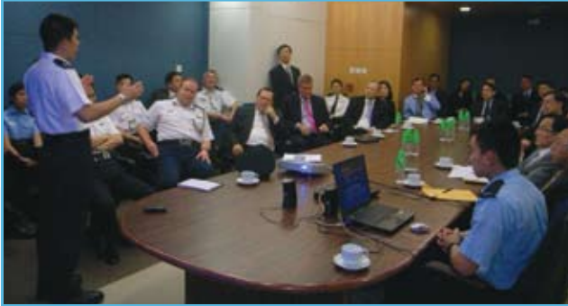
中區指揮官和副指揮官向委員講解警方如何處理大型公眾活動和面對的困難。 Senior management brief Members on the handling of public order events and the difficulties in policing those events.

Forum with frontline officers in Hong Kong Island Region