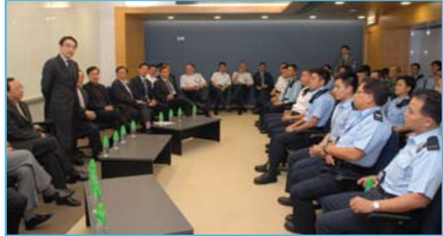
來自衝鋒隊、警察機動部隊和中區的前線警務人員出席座談會。 Frontline officers from Emergency Unit, Police Tactical Unit and Central District attend the forum.