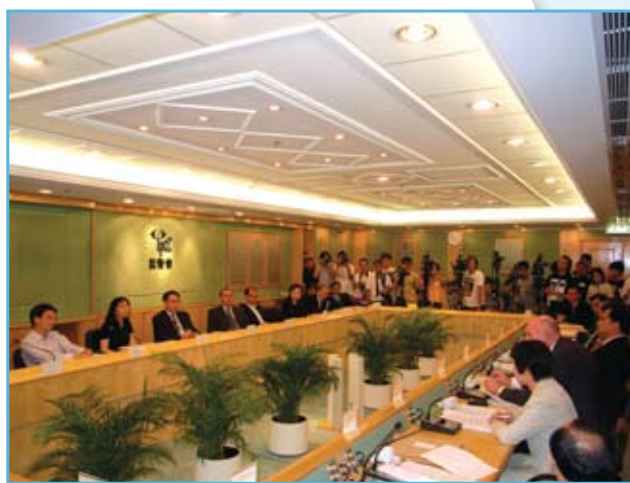
監警會 / 投訴警察課聯席會議 (2009年9月4日) Joint IPCC/CAPO meeting (4 September 2009)

IPCC expressed its concern whether existing police practices and procedures regarding the setting up of roadblock were appropriate having regard to the safety of the public. This issue attracted public attention subsequent to a police operation to stop illegal racing cars on Kwun Tong Bypass in July 2009 where vehicles from members of the public were stopped to block the road. Representatives from Police Traffic Headquarters were invited to introduce to IPCC the operations and procedures against illegal car racing and the follow-up actions in relation to the Kwun Tong Bypass incident.