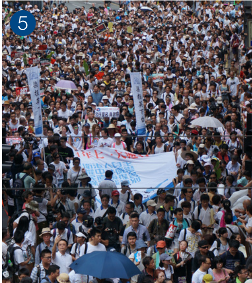
5) 參加者沿遊行路線至遮打道集會 Participants proceeded to the public gathering at Chater Road along the procession route