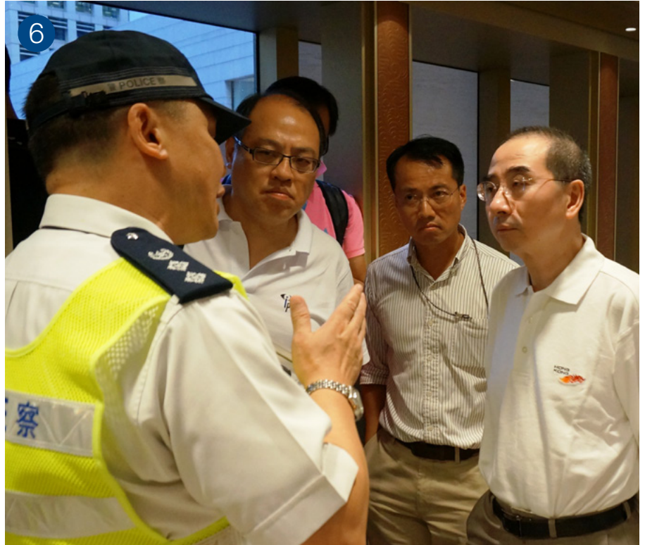
6) 委員由警方陪同下到中環觀察集會情況 Members proceeded to the public gathering in Central accompanied by the Police

委員由警方陪同下到多個據點觀察，首先到警方的指揮中心聽取警方的簡報，隨後沿著遊行路線到各個警方管制人流的策略性據點觀察，包括維園一帶、崇光百貨公司外的位置和灣仔軒尼詩道等，並前往中環觀察在該處舉行的公眾集會。為全面觀察遊行的情況，秘書處的職員亦分成多個小組，在不同的據點作定點觀察，以掌握更全面的資料。