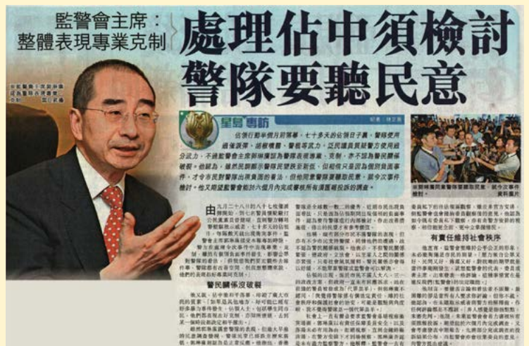
原文刊於星島日報 2014 年 12 月 25 日 (A10) Published in Sing Tao Daily on 25 December 2014 (A10)