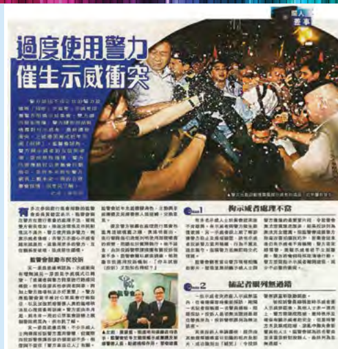
原文刊於爽報(V15) 2012年5月23日 Published in Sharp Daily (V15) on 23 May 2012

In April to May 2012, the IPCC worked with a free newspaper to publish IPCC columns for six weeks, including interviews with the IPCC Committee Members and explanations of complaint cases. These were recorded as video clips and posted on the newspaper's website. This cooperation with the free newspaper proved very successful, given that the IPCC column received one of the highest hit rates on the free newspaper's website.